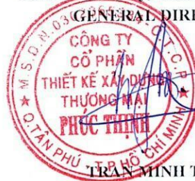
TRAN MINH TRUC