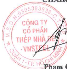
Pham Cong Dung