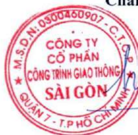
Hoang Ngoc Hung