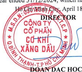
ĐOÀN ĐỨC HỌC