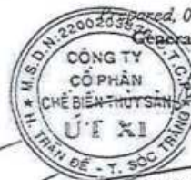
Ly Bich Quyen