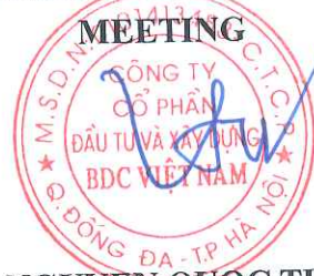
NGUYEN QUOC TU