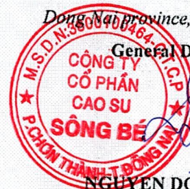
NGUYEN DONG DAN