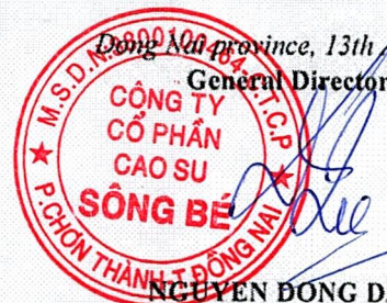
NGUYEN DONG DAN