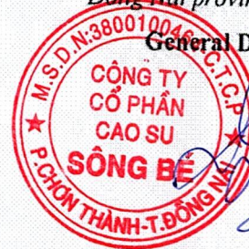
NGUYEN DONG DAN