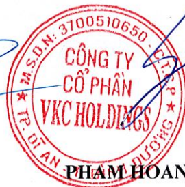
PHAM HOANG PHONG