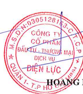
HOANG HUY HUNG