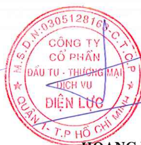
HOANG HUY HUNG