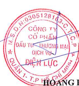
HOANG HUY HUNG