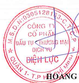
HOANG HUY HUNG