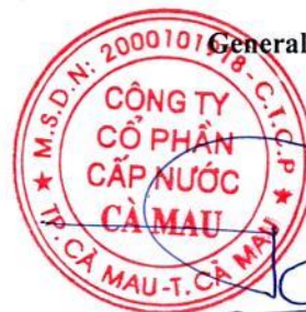
Pham Phuoc Tai