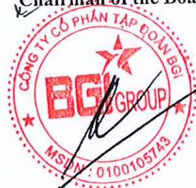
Hoang Trong Duc