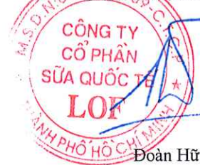
Đoàn Hữu Nguyên