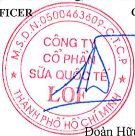
Đoàn Hữu Nguyên