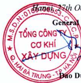
Đào Đức Thọ