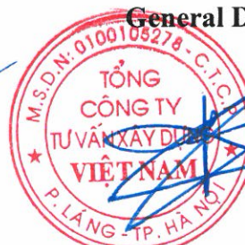
Tran Duc Toan