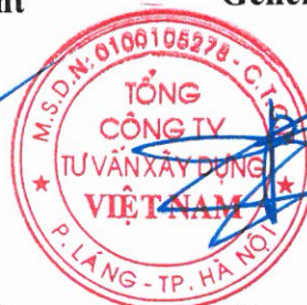
Tran Duc Toan