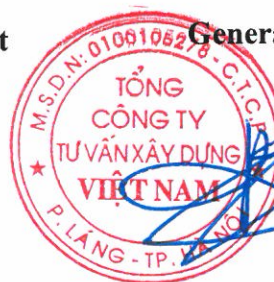
Tran Duc Toan