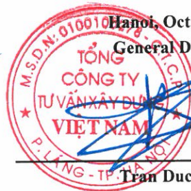
Tran Duc Toan