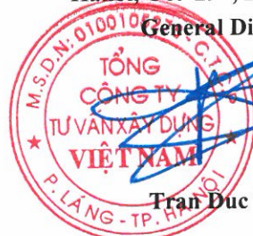
Tran Duc Toan