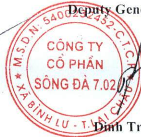
Đinh Trọng The