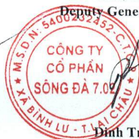
Dinh Trong The