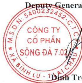
Dinh Trong The