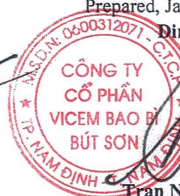
Tran Ngoc Hung