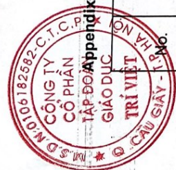
Appendix 02: List of insiders and related persons of insiders of Tri Viet Education Group Joint Stock Company.