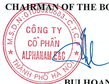
BUI HOANG TUAN