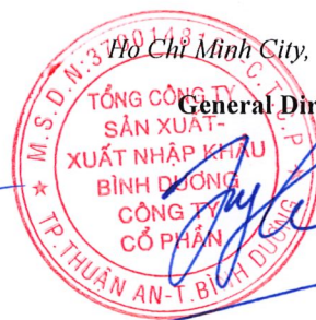
Le Trong Nghia