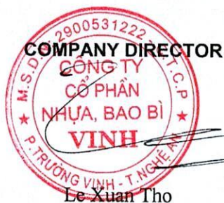
Le Xuan Tho

Thus, the increase in net profit in the first quarter of this year was mainly due to increased revenue and reduced administrative expenses, despite a sharp rise in raw material prices.